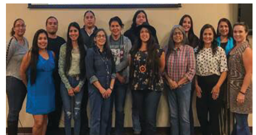
TOP PHOTOS LEFT TO RIGHT: HR Orientation budgeting activity for new employees; Nez Perce Tribal Enterprises "stokers" division 1st Place winners at Nimiipuu Fund Golf Scramble; NPTEC Team at Nimiipuu Fund Golf Scramble. BOTTOM PHOTOS LEFT TO RIGHT: Nimiipuu Fund Staff and Board members at Native Access to Capital Convening; Native Artist Professional Development Training hosted by Nimiipuu Fund and First Peoples Fund.